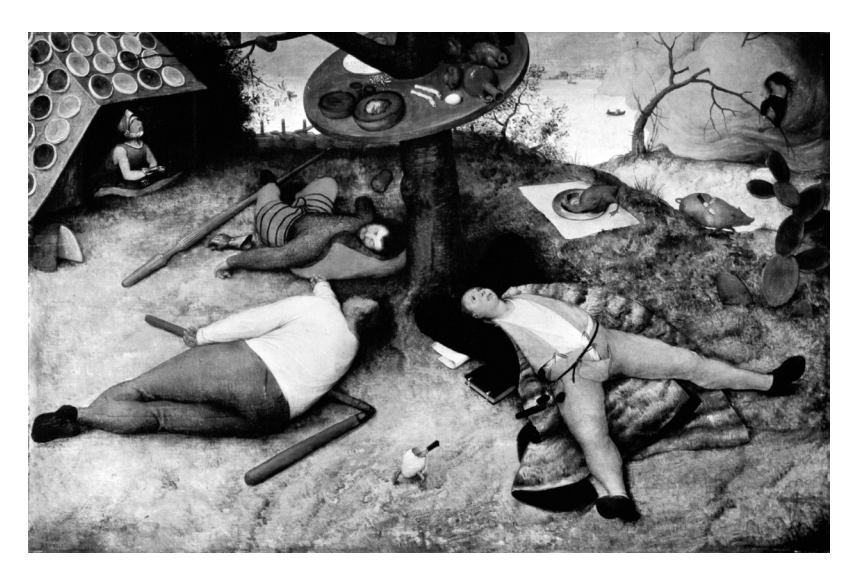
Pieter Bruegel the Elder, 'The Land of Cockaigne', 1567. Alte Pinakothek, Munich.

realities they pretend to transfigure. Every Eden is the here and now intensified; immortality is mortality continuing; every vision of bliss is bodily and appetitive, heavy and ordinary and present-centred. The man emerging from the mountain of gruel in the background is the 'modern' personified. He has eaten his way through to the community of saints.