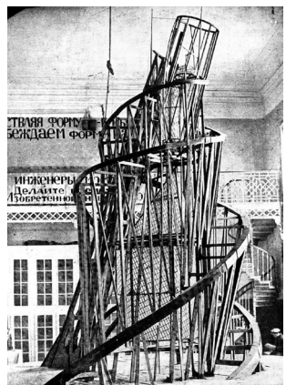
Pieter Bruegel the Elder, 'The "Little" Tower of Babel', c. 1565. Museum Boijmans van Beuningen, Rotterdam; Model of Tatlin's Monument to the Third International, c. 1919–20.

look grey.) Left, then, is a term denoting an absence; and this near non-existence ought to be explicit in a new thinking of politics. But it does not follow that the left should go on exalting its marginality, in the way it is constantly tempted to—exulting in the glamour of the great refusal, and consigning to outer darkness the rest of an unregenerate world. That way literariness lies. The only left politics worth the name is, as always, the one that looks its insignificance in the face, but whose whole interest is in what it might be that could turn the vestige, slowly or suddenly, into the beginning of a 'movement'. Many and bitter will be the things sacrificed—the big ideas, the revolutionary stylistics—in the process.